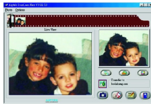
Figure 4: Taking snapshots