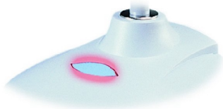
Figure 3: FlexC@m hardware snapshot button