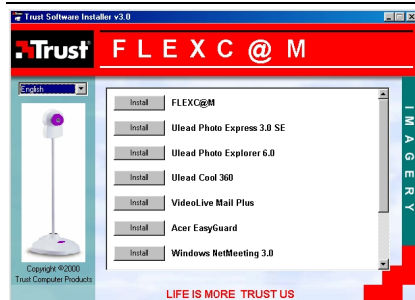
Figure 1: Installer